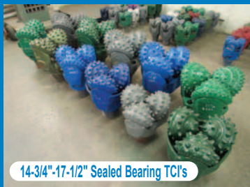
14-3/4"-17-1/2" Sealed Bearing TCI's