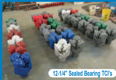
12-1/4" Sealed Bearing TCI's