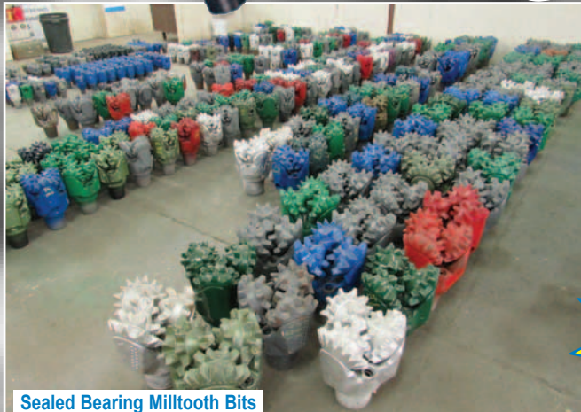
Sealed Bearing Milltooth Bits

NOTE: For Complete List of Bidding Terms & Conditions, Visit www.SuperiorAuctioneers.com/terms