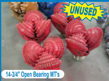
14-3/4" Open Bearing MT's