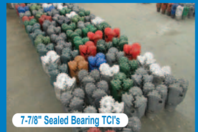
7-7/8" Sealed Bearing TCI's