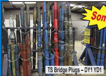
TS Bridge Plugs - DY1 YD1