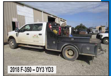
2018 F-350 - DY3 YD3