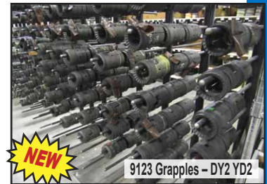
9123 Grapples - DY2 YD2