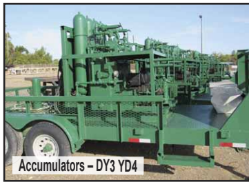
Accumulators - DY3 YD4