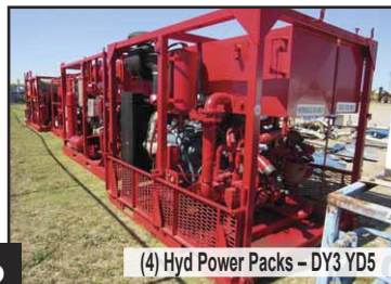
(4) Hyd Power Packs - DY3 YD5