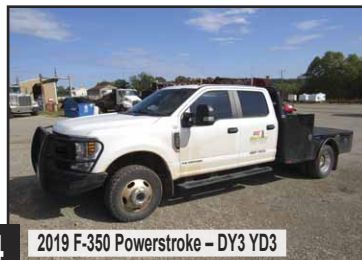
2019 F-350 Powerstroke - DY3 YD3