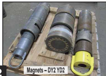
Magnets - DY2 YD2