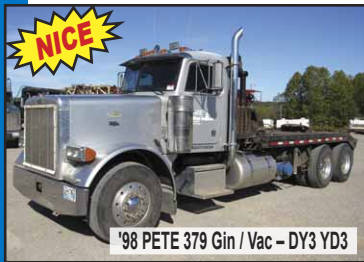
'98 PETE 379 Gin / Vac - DY3 YD3