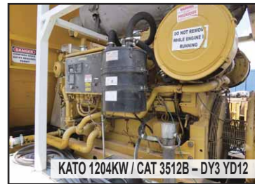
KATO 1204KW / CAT 3512B - DY3 YD12

(4) 2015 - 2012 FORD F-250 4x4 Crew Cab Pickup Trucks p/b Diesel & Gas Eng's