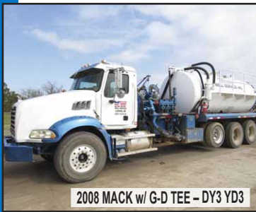
2008 MACK w/ G-D TEE - DY3 YD3