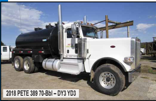
2018 PETE 389 70-B6I - DY3 YD3