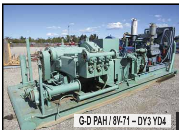
G-D PAH / 8V-71 - DY3 YD4