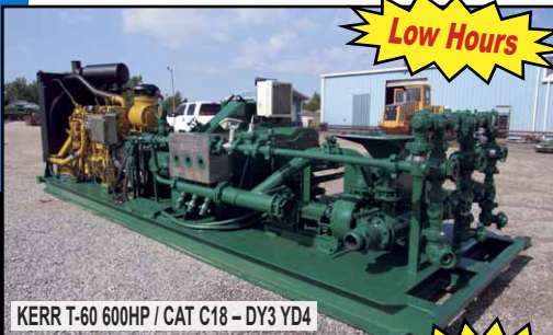
KERR T-60 600HP / CAT C18 - DY3 YD4