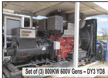
Set of (3) 800KW 600V Gens - DY3 YD8

(2) 2007 DRAGON 130-Bbl T/A Vac Trailers