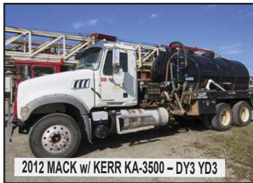
2012 MACK w/ KERR KA-3500 - DY3 YD3