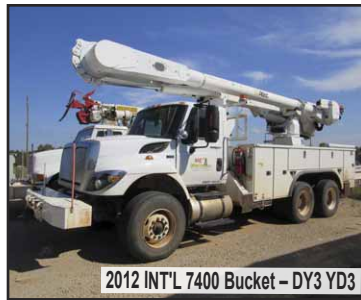
2012 INT'L 7400 Bucket - DY3 YD3