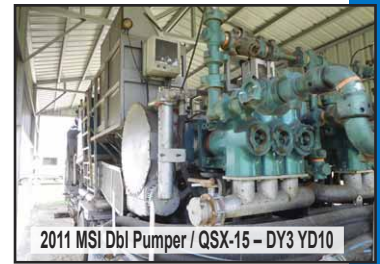
2011 MSI Dbl Pumper / QSX-15 - DY3 YD10