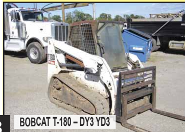
BOBCAT T-180 - DY3 YD3