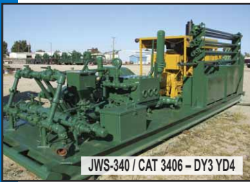
JWS-340 / CAT 3406 - DY3 YD4