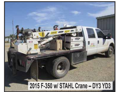
2015 F-350 w/ STAHL Crane - DY3 YD3