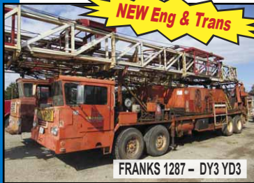
FRANKS 1287 - DY3 YD3