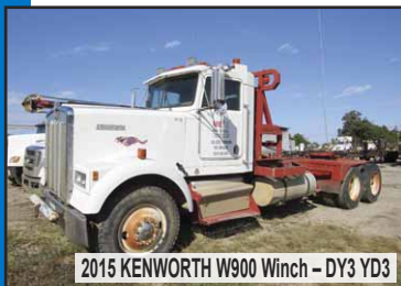
2015 KENWORTH W900 Winch - DY3 YD3

'98 PETERBILT 379 6 x 4 T/A Gin/Vac Truck, w/ (2) Winches, FRUITLAND Vac Pump