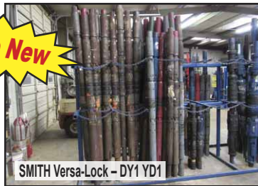
SMITH Versa-Lock - DY1 YD1