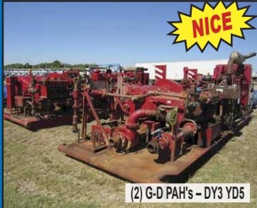
(2) G-D PAH's - DY3 YD5