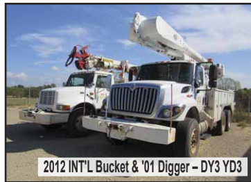
2012 INT'L Bucket & '01 Digger - DY3 YD3