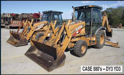
CASE 580's - DY3 YD3