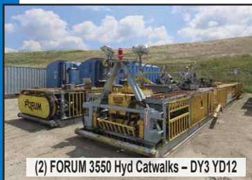
(2) FORUM 3550 Hyd Catwalks - DY3 YD12

Asst'd Triplex Pump Parts • Roller Chain • Weld Fittings • SS Flex Hoses • Pump Drive Pedestal • Exhaust Expansion Joints • I-R Air Starters • (3) BOSTON HOIST 10"D x 6'L Hyd. Hoists (UNUSED) • Vibrator Motors • Rig Tarps (UNUSED)