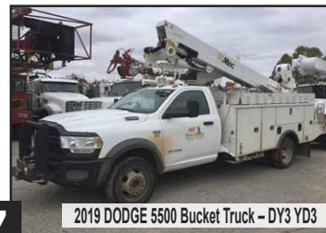
2019 DODGE 5500 Bucket Truck - DY3 YD3