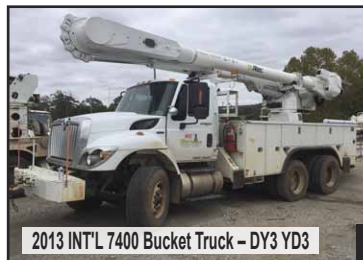
2013 INT'L 7400 Bucket Truck - DY3 YD3