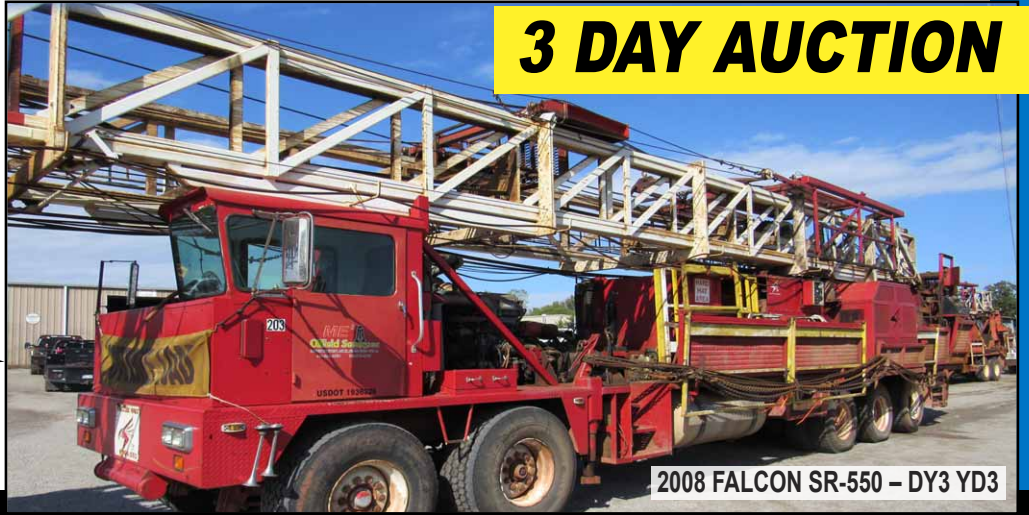
2008 FALCON SR-550 - DY3 YD3