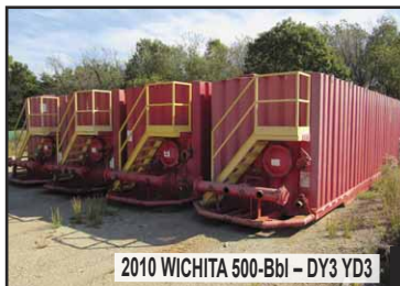
2010 WICHITA 500-Bbl - DY3 YD3