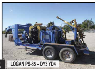
LOGAN PS-85 - DY3 YD4