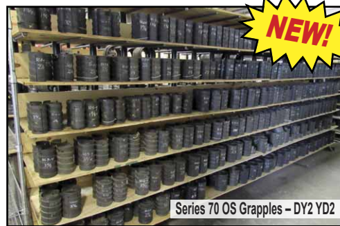
Series 70 OS Grapples - DY2 YD2