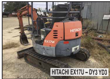
HITACHI EX17U - DY3 YD3