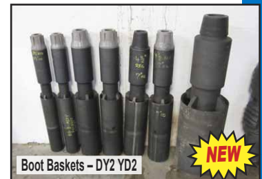
Boot Baskets - DY2 YD2