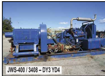
JWS-400 / 3408 - DY3 YD4