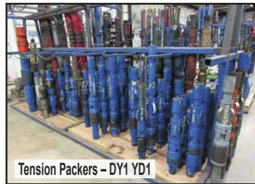
Tension Packers - DY1 YD1