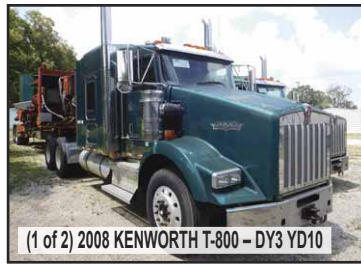
(1 of 2) 2008 KENWORTH T-800 - DY3 YD10