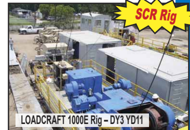
LOADCRAFT 1000E Rig - DY3 YD11