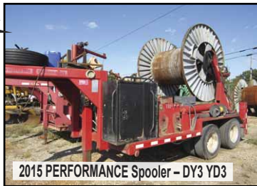
2015 PERFORMANCE Spooler - DY3 YD3