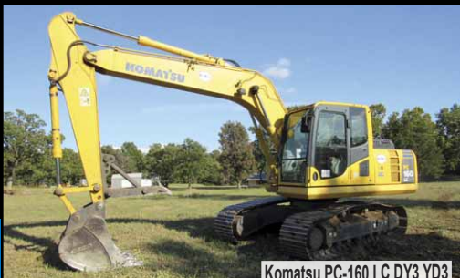
Komatsu PC-160 LC DY3 YD3