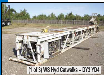
(1 of 3) WS Hyd Catwalks - DY3 YD4

Tools for (4) Well Service Rigs; BJ RS Tongs, Air Slips, Tubing Elevators, Rod Tools, Weight Indicators, Oil Savers, Mouse Traps, Rod Overshots, Numerous Tricone Drill Bits, Tubing & Drill Collar Changeover Subs & Lift Subs