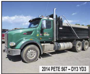
2014 PETE 567 - DY3 YD3