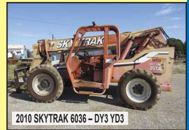
2010 SKYTRAK 6036 - DY3 YD3

(3) INDUSTRIAL RUBBER 4-1/2" 2-Stage Cementing Tools ( NEW ) Cement Retainer Mechanical Setting Tools: 8-5/8" • (2) 7" • (1) 5-1/2" • (1) 4-1/2"