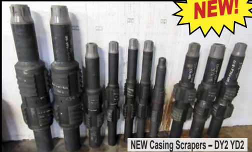
NEW Casing Scrapers - DY2 YD2