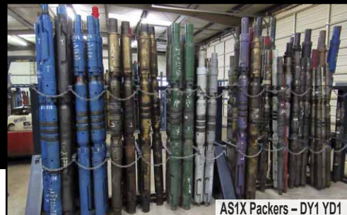
AS1X Packers - DY1 YD1