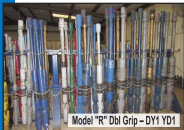
Model "R" Dbl Grip - DY1 YD1

(2) WEATHERFORD 7" Stage Tools, 26# w/ Buttress (NEW)