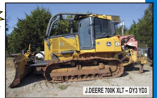
J. DEERE 700K XLT - DY3 YD3