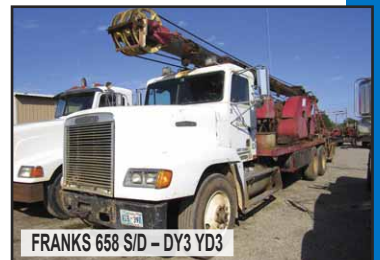
FRANKS 658 S/D - DY3 YD3