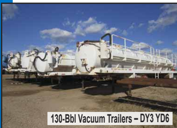
130-Bbl Vacuum Trailers - DY3 YD6

McKISSICK 83 100-Ton 3-Sh Tubing Blocks • McKISSICK 73 50-Ton 3-Sh Tubing Blocks • KING 1-3/4" x 60" Elevator Links (MPI'D) • MYT Slip Type Tubing Elevators, 2-3/8" (NEW) • 310' (10 Jts) 4"OD Washpipe w/ FJWP