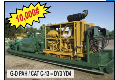
G-D PAH / CAT C-13 - DY3 YD4