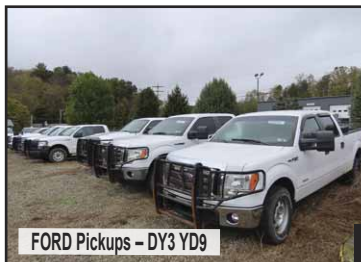
FORD Pickups - DY3 YD9