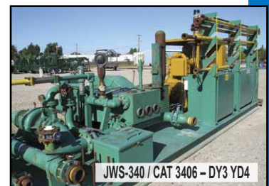
JWS-340 / CAT 3406 - DY3 YD4