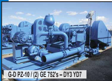
G-D PZ-10 / (2) GE 752's - DY3 YD7

651' (21Jts) 1" 2.54# R-2 Tubing w/ CS Hyd