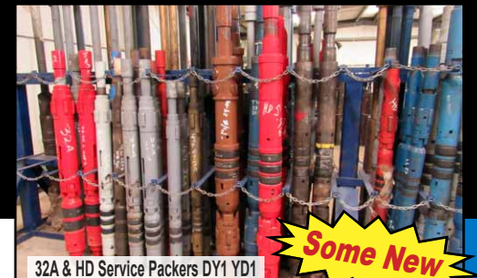
32A & HD Service Packers DY1 YD1