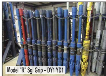
Model "R" Sgl Grip - DY1 YD1