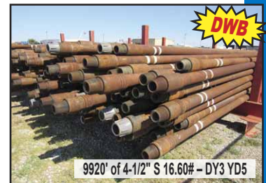
9920' of 4-1/2" S 16.60# - DY3 YD5